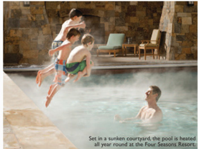
Set in a sunken courtyard, the pool is heated all year round at the Four Seasons Resort.