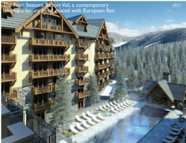
The Four Seasons Resort Vail, a contemporary landmark luxury hotel, graced with European flair.